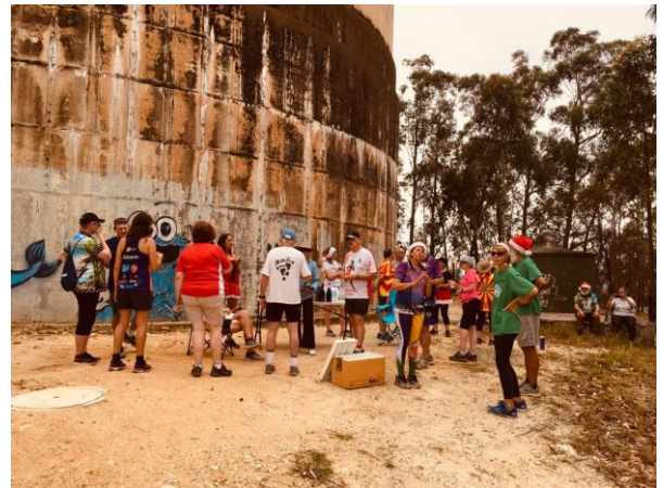
The runners also got there.