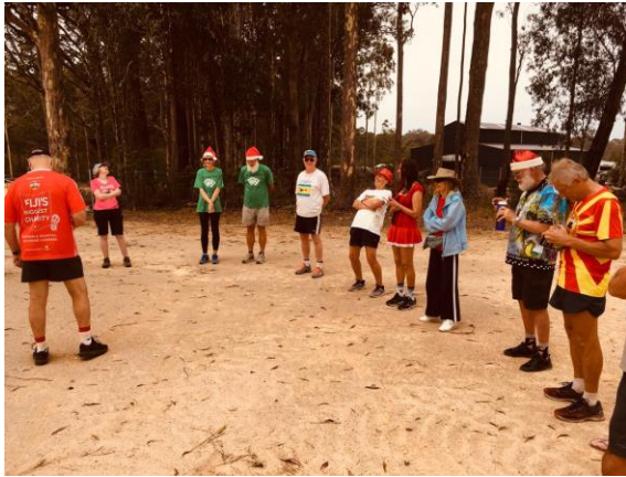
Umm, what comes next