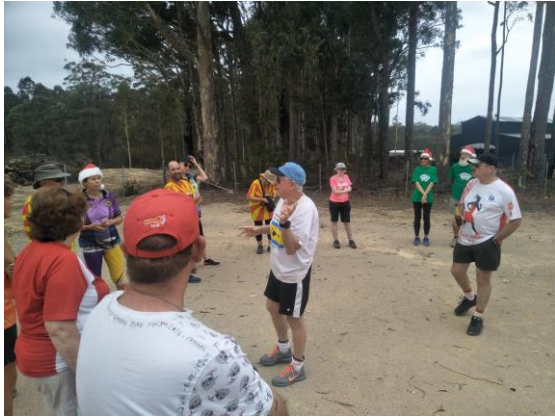
The stand in hair (following a pre navigated trail) gives useful instructions. To which someone may have listened.