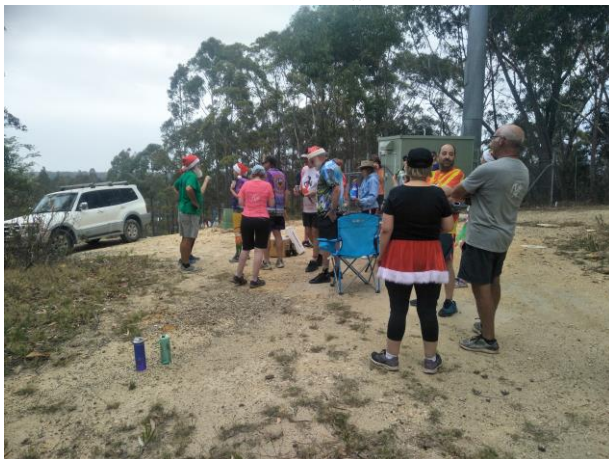
The walkers found the drink stop first. Pugwash and Bunz in charge.