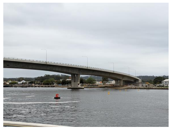
which served as a suitable place for him to burst into enthusiastic season songs.