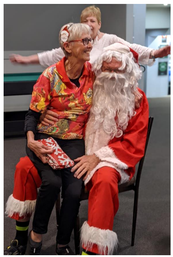
After which it all got a bit messy.