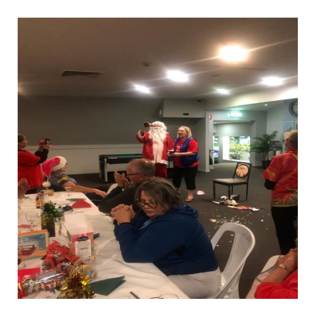
And he handed out gifts of great value and some dubious attraction.