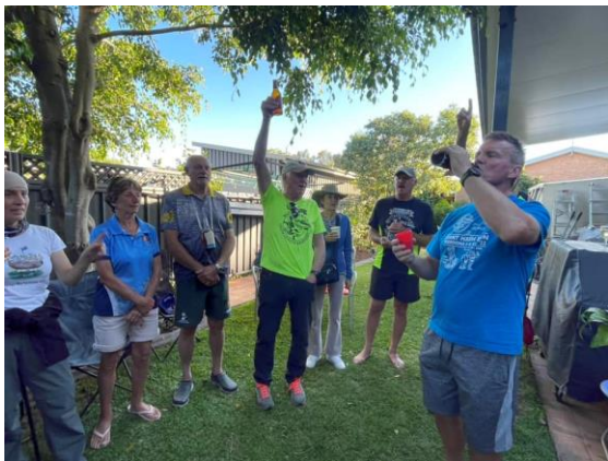
The Gin Slut and BlackDog looked on with Bubbles and generally created the normal amount of havoc