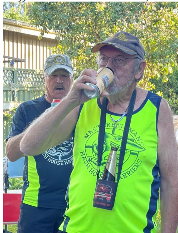
And DUI set new standards (predictably low) of sartorial splendour.