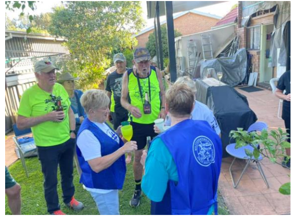
as the stand in GeeEmm (Two Fathers) struggled to maintain order. And sobriety.