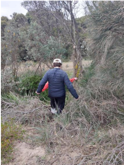
and SueEllen fell A over T.

About now it got sorta messy. The pack lost trail again for a while as DUI went one way and Wishing Well gave no hints and the pack leaders (see above) sorta searched fruitlessly for sign until there was an indication of possibility that it went in here