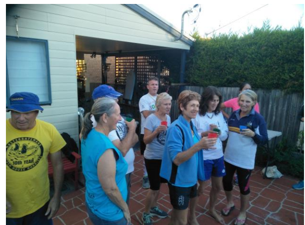
Chattering class assembled.

According to ill-informed saucers close to round circles and likely fake news on Facebook there was a lot of chatter.