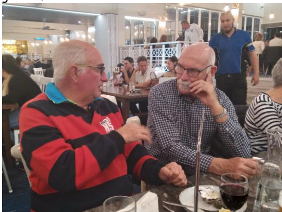
Before being photo bombed.