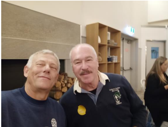
the group repaired to the much vaunted Cat Club where good taste was established.