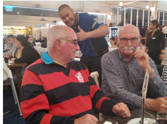
(There is a village out there missing an idiot.)