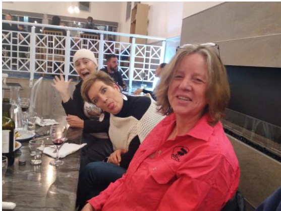
Others solved the problems of the world over a glass of red