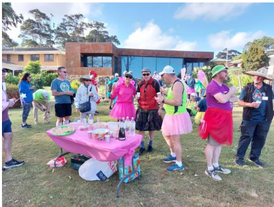
Everyone cheered or waved or drank pink gin.