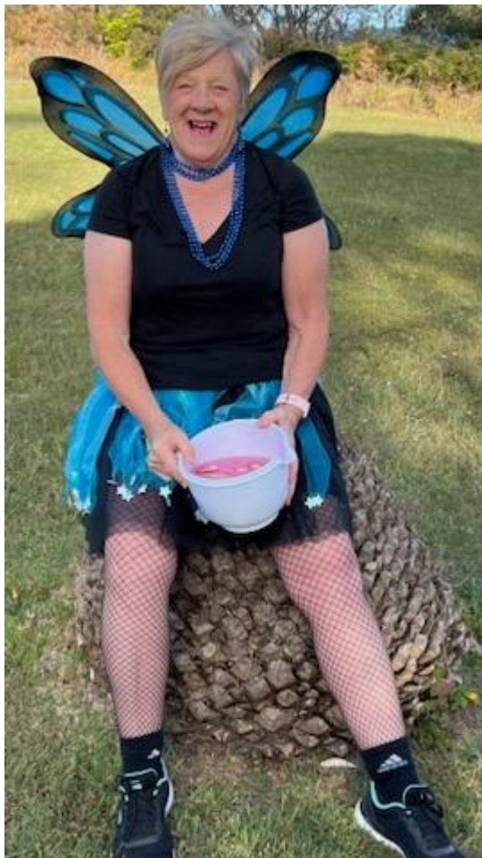
But I digress.

The whole thing was a minor miracle. Frastart, the nominal fairy live hair, Energizer , departed a few minutes before the pack carrying only a small piece of chalk and a champagne flute. (Full) Somehow, she managed to set a run that musta contained about 3kg of flour, piled generously every few metres until the high water mark near the end. And at the drink stop she looked as refreshed as if she had only walked about 150m to get there. I dunno how she dunnit. Maybe it was the small bucket of pink gin.