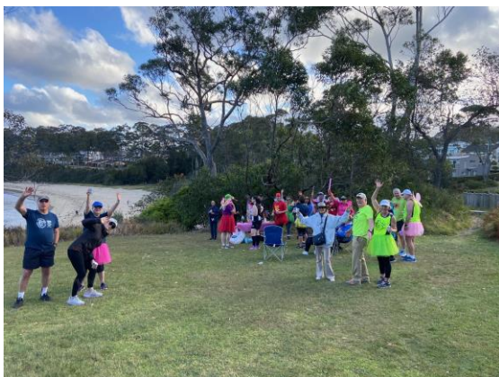
Some people looked pleased that they had got away with it again (and found the drink stop early).

From there it was a mere gambol back to the start/finish and a chaotic circle.