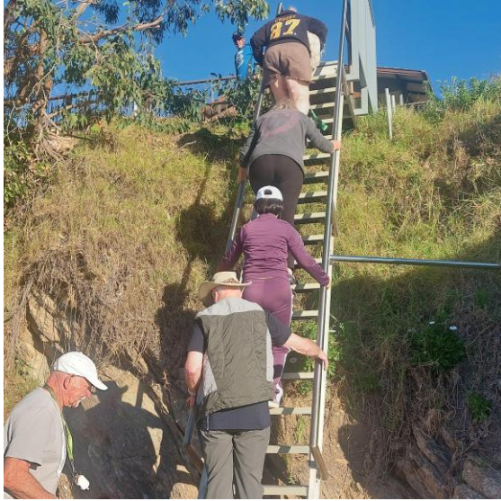
Closely observed by some observant locals